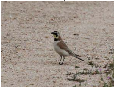
Horned Lark / Don Klabunde