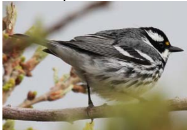
Black-throated Gray Warbler / Don Klabunde

A cold drizzly day, but gloriously beautiful wildflowers and a number of fun birds: Black-throated Gray Warbler, Horned Lark, Ash-throated Flycatcher, Bullock's Oriole, Northern Harrier, and Savanna Sparrow. A total of 22 species observed.